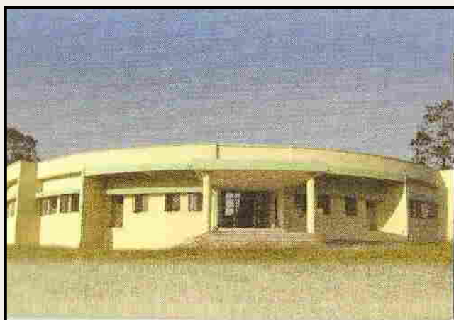
Administrative office at Diphu

Academic and Administrative activities for the Diphu Campus is at present being carried out in a temporary accommodation as the construction of the appropriate infrastructure in the permanent campus site is in progress. Arrangement of Hostel accommodation for students is in the process.