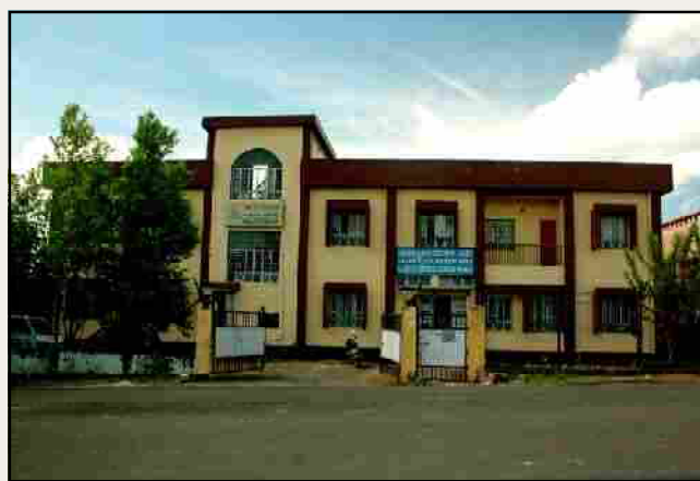
University Health Centre

The University Health Centre, managed by experienced Medical personnel including Lady Medical Officer, supported by para-medical staff. The centre cater to the medical needs of the University community. The University has introduced Medical Insurance to each students. Besides these, health camps are frequently