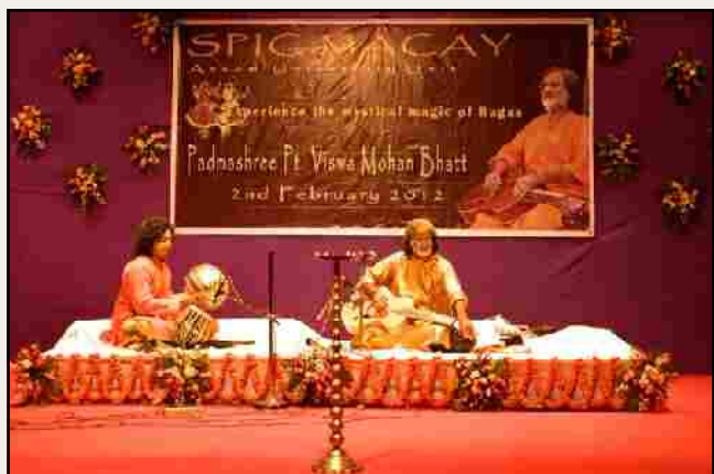
Padmashree Pt. Viswa Mohan Bhatt playing Mohan Bina at Bipin Chandra Pal Milanayatan.

is to render financial assistance to poor and deserving students for payment of tuition fees, examination fees, purchase of text books, stationery etc. A student requiring financial assistance from the Fund shall have to apply in the prescribed form through the concerned Head of the Department.